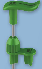
Double cavity stainless steel stylet

“Either direct or indirect intubation, our stylets are the ideal tool to help improve the success rate of intubation.”