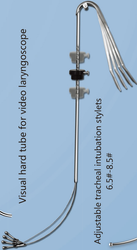
Adjustable tracheal intubation stylets 6.5#-8.5#