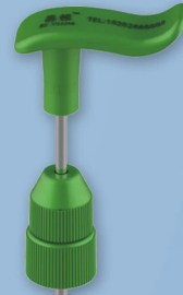
Ordinary stainless steel stylet 5.0#-8.5#